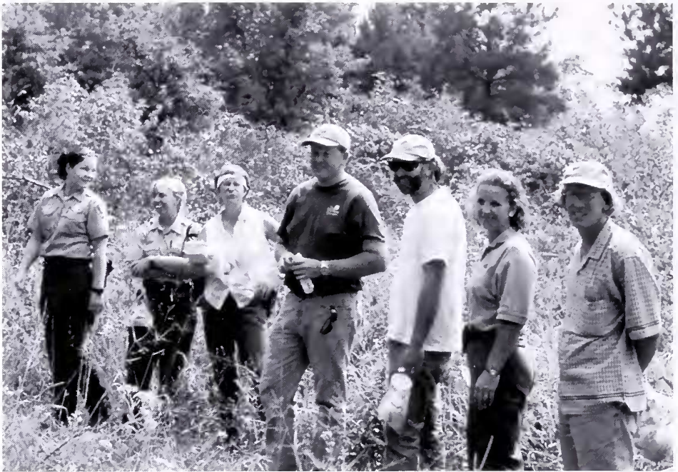
Figure 1: Several meeting attendees review the management actions at a Sarracenia oreophila seepage bog.